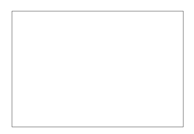
Figure 1. Example of caption. It is set in Roman so that mathematics (always set in Roman: B \sin A = A \sin B ) may be included without an ugly clash.