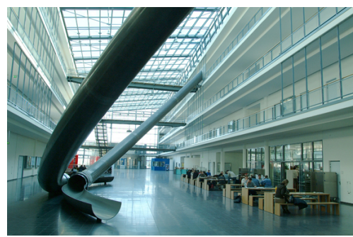
(b) The famous slide.