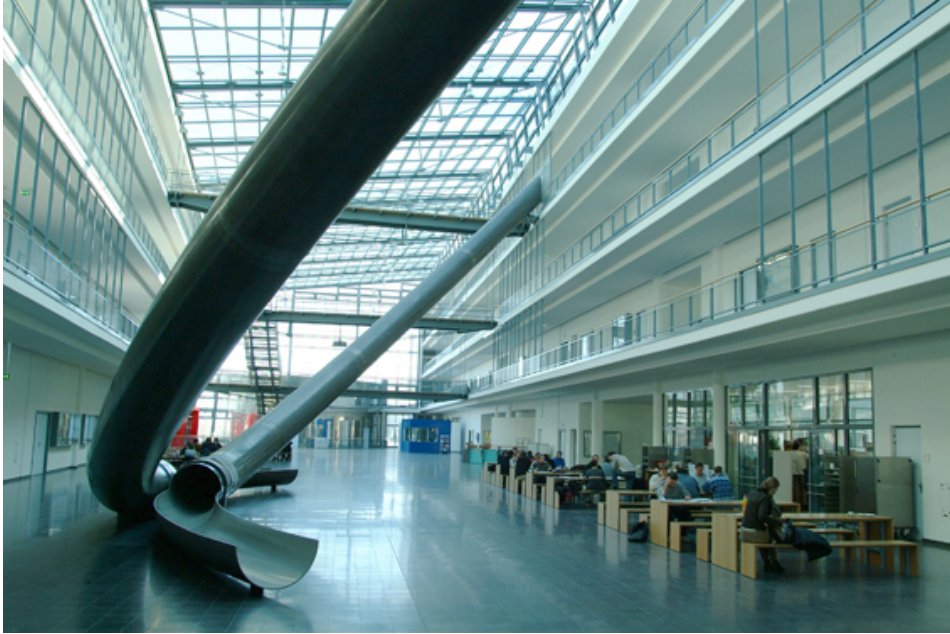
Figure 1.5.: For pictures with the same name, the direct folder needs to be chosen.