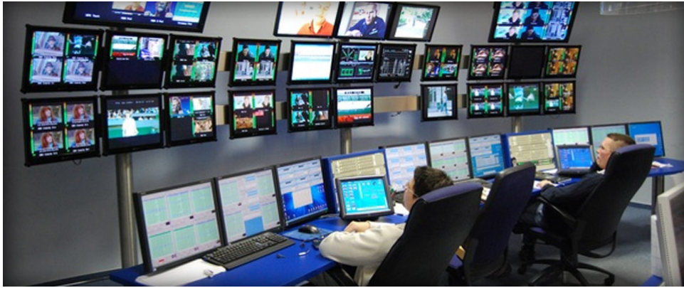
Figure 1.1: CCTV monitoring room.

Finally, in Chapter 5, I conclude my thesis.