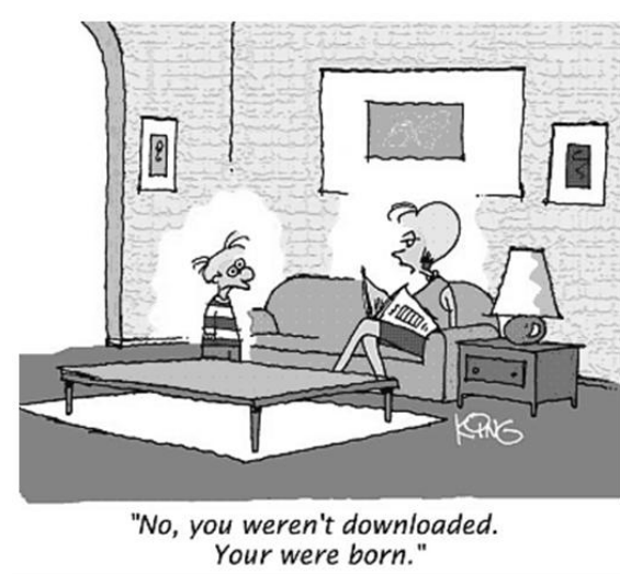
Figura 1. A typical figure

Figure and table captions should be centered if less than one line (Figure 1), otherwise justified and indented by 0.8cm on both margins, as shown in Figure 2. The caption font must be Helvetica, 10 point, boldface, with 6 points of space before and after each caption.