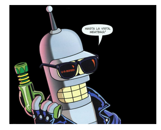
Figure 1: Concept art for Killer Robot prototype[4]