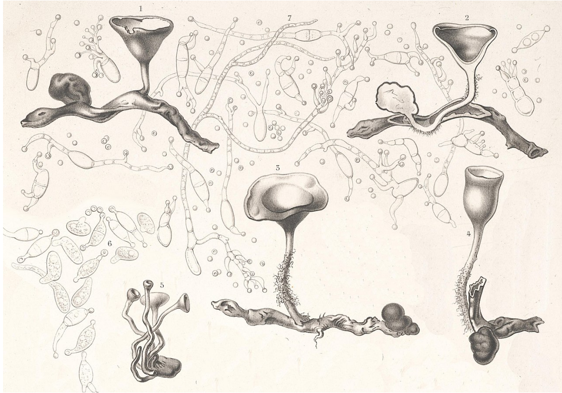
Figure 3.1: Illustration of the fungus Dumontinia tuberosa by physician, mycologist, and illustrator Charles Tulasne (1816–1884) in the book Selecta Fungorum Carpologia (1861–65). (Name of the original work: Peziza tuberosa parasite on Anemone nemorosa ).

necessary, consider including citations or references to indicate the figure's origin. The caption environment is denoted as \caption{TEXT} . To generate a smaller caption for the Table of Figures, be sure to utilise the format \caption[SMALL_TEXT]{BIG_TEXT} . By following the aforementioned tips, we can create a figure as demonstrated in Figure 3.1 .